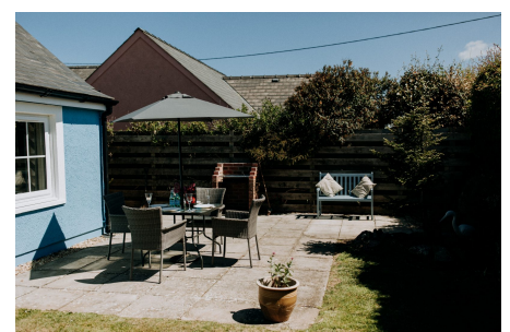
Garden & Terrace