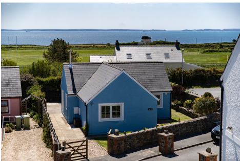
Gated Entrance & Drive