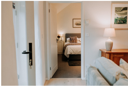
View to Bedroom From Lounge