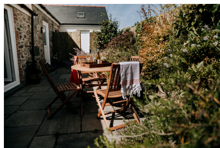
Rear Garden Patio Area