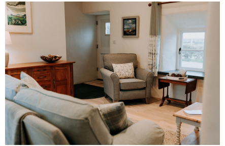
Lounge (and entrance door)