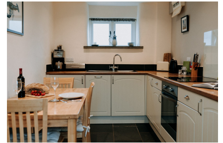
Kitchen Dining Area