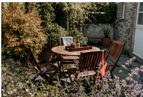
Rear Garden Patio Area