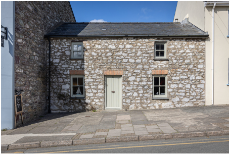
Parking Area & Entrance Door