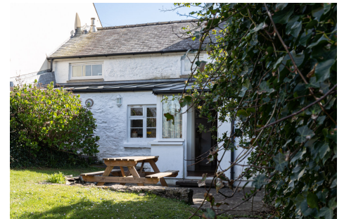
Garden Patio & Raised Lawn