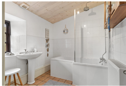
Ground Floor Bathroom