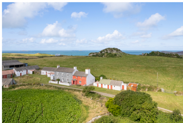
Track & Adjoining Properties