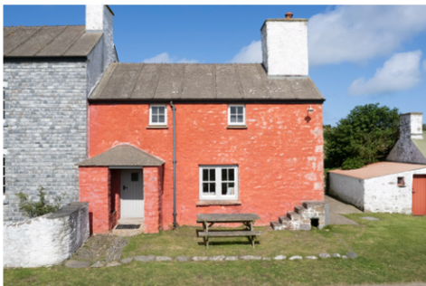
Entrance & Front Dining Area