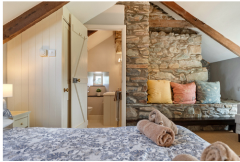
Kingsize Ensuite Bedroom