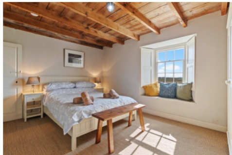
FF Double Bedroom