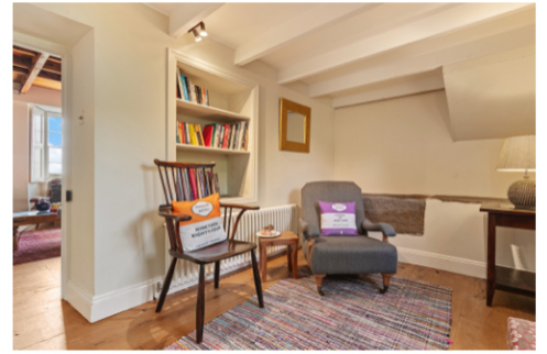
Ground Floor Single Bedroom