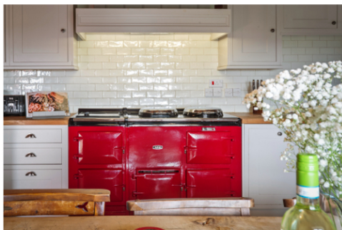
AGA & Ceramic Hob