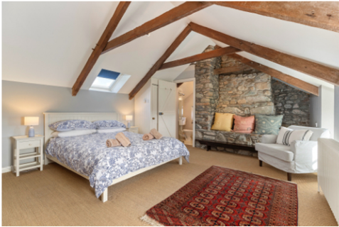
Kingsize Ensuite Bedroom