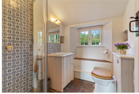
Ground Floor Shower Room