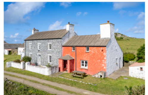
External Area & Adjoining Property