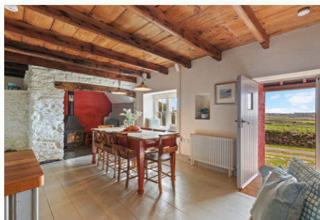
Entrance Into Kitchen & Dining Area