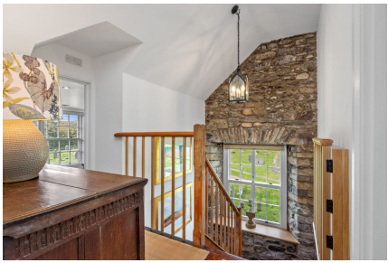
Landing & Stair