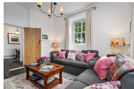
Lounge - Entry From Hall