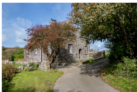
Gravel Parking Area