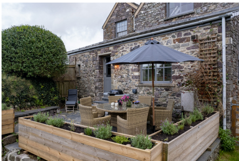
Rear Garden Terrace