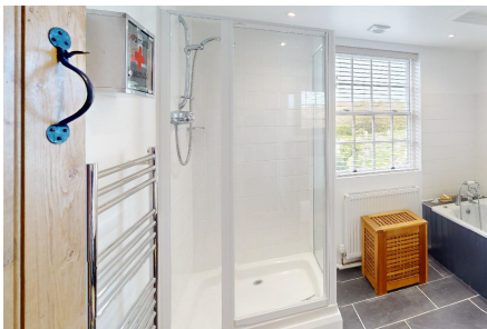
Bathroom & Shower