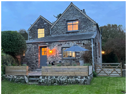
Garden & Gate to Parking Area