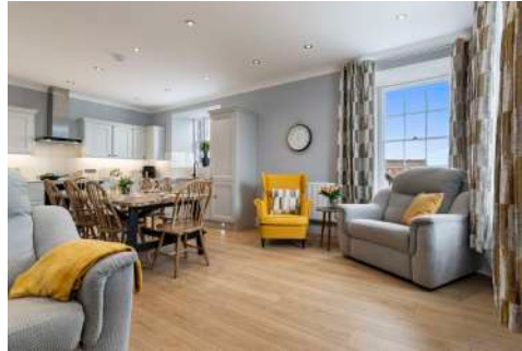
Open Plan Area - Dining Area