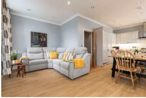
Open Plan Area - Lounge