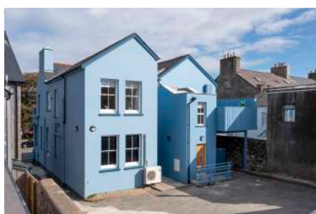
Rear Entrance & Parking Area