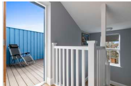
First Floor Hall & Door To Patio