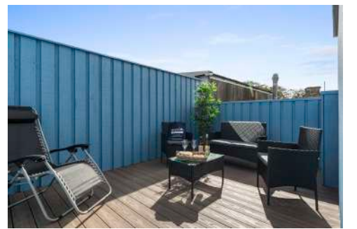
First Floor Patio