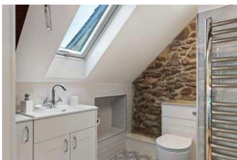
Master Bedroom Ensuite