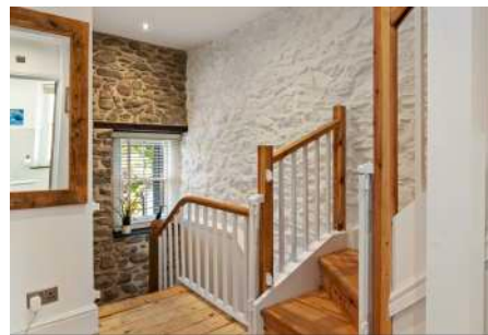
1st Floor Landing