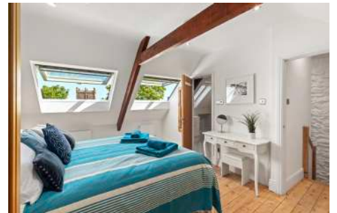
2nd Floor Master Bedroom