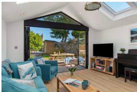
Lounge to Garden