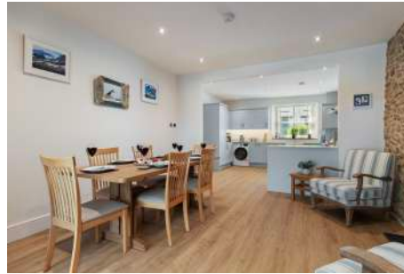
Dining Area to Kitchen