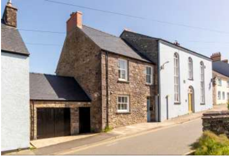
Property From Street