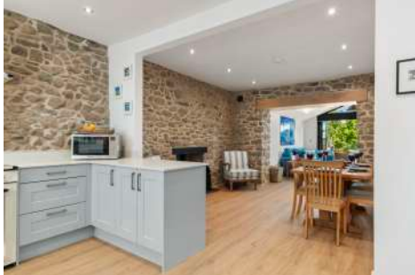
Kitchen to Dining Area & Lounge