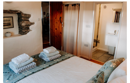
Bedroom (looking to shower)