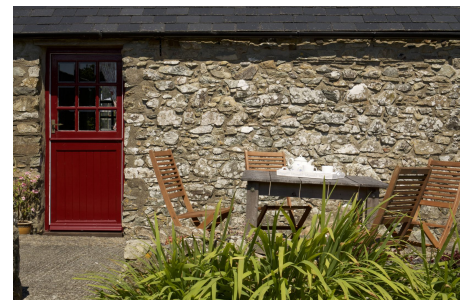
Rear Terrace & Garden