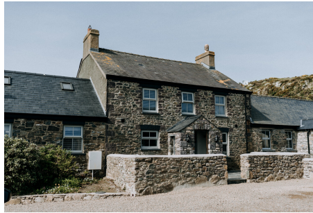
Parking Area & Entrance