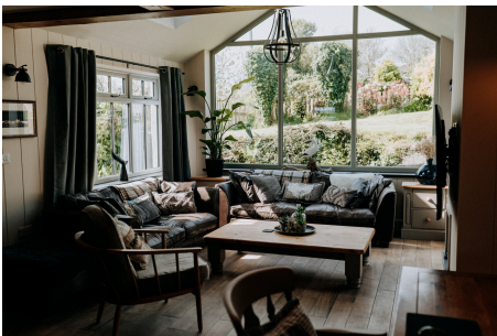
Lounge (looking out to garden)