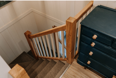
Stair to First Floor