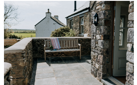
Front Paved Area