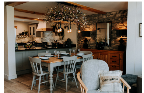
Dining Area & Kitchen