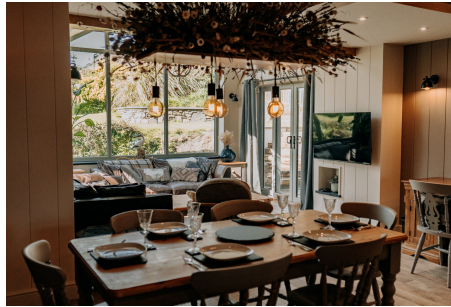
Dining Area & Lounge