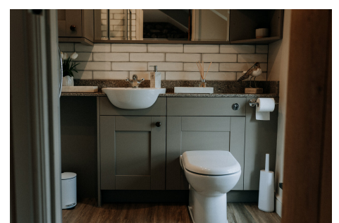
Ensuite Shower Room Vanity