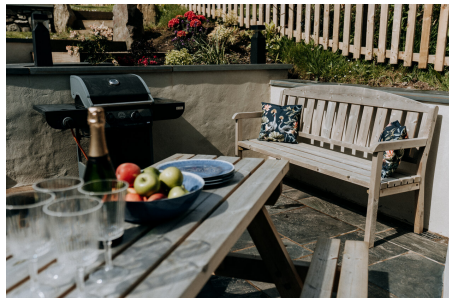
Garden Patio Area