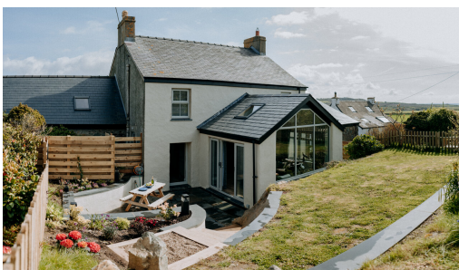
Rear Garden (steps to raised area)