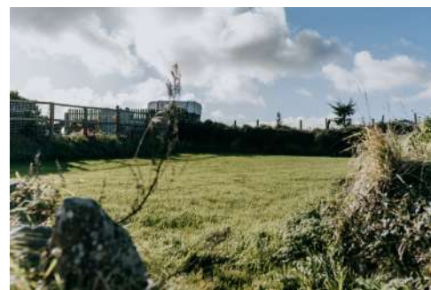
Fenced Paddock Field