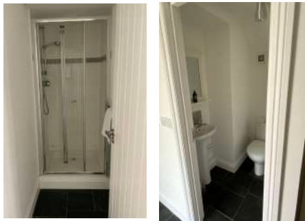
Ground Floor WC & Shower