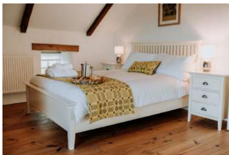
FF Bedroom 1 (king size bed)