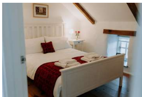
FF Bedroom 2 (King size bed)