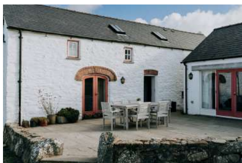
Entrance & Paved Area