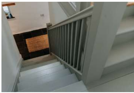
Stair to FF Bedrooms