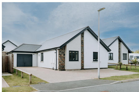
Parking & Entrance