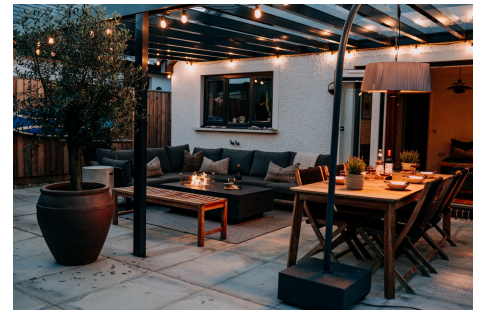
Outdoor Living Area