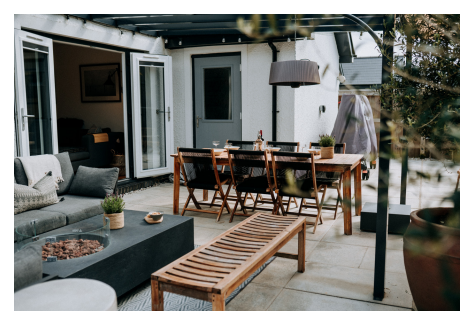
Outdoor Living Area