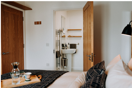
Kingsize Ensuite Bedroom