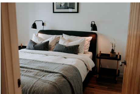
Kingsize Ensuite Bedroom