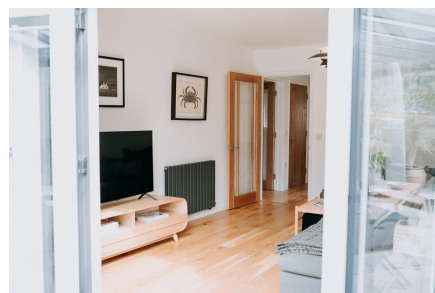
Lounge Access from Hall