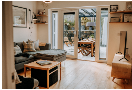
Lounge & Doors to Outdoor Living Area