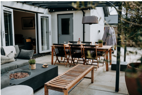
Outdoor Living Area