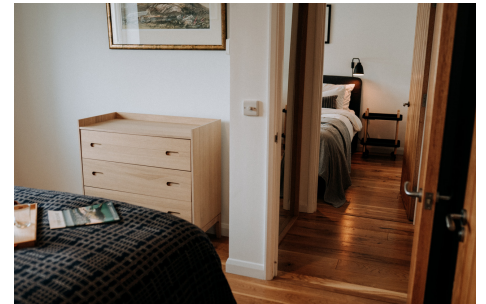
Level Access From Hall