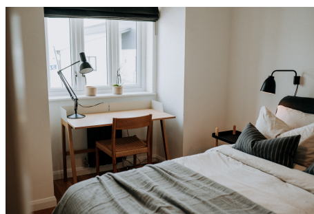
Kingsize Ensuite Bedroom