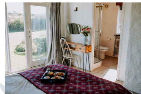
Upper Ground Floor Kingsize Bedroom & Ensuite Shower Room