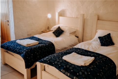
Lower Ground Floor Twin Bedroom