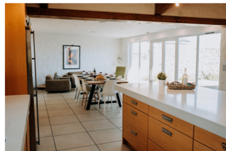
Dining Area & Entrance