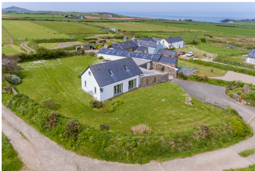
Garden & Approach Road