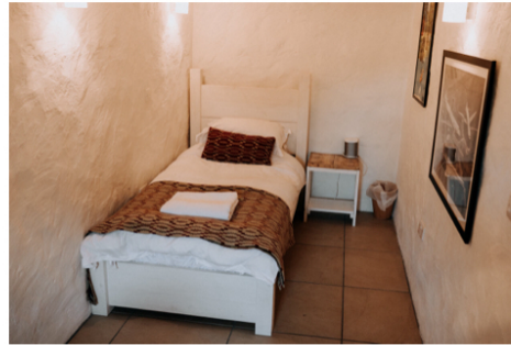
Lower Ground Floor Single Bedroom