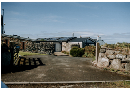
Parking Area & Slope to Entrance