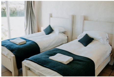
Upper Ground Floor Twin Bedroom