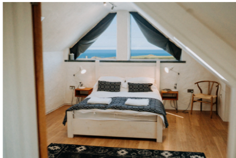
First Floor Super King Ensuite Bedroom (restricted head height)