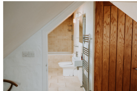
First Floor Ensuite Bathroom (restricted head height)