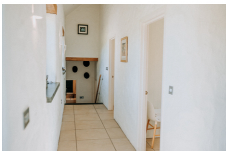
Upper Ground Floor Landing