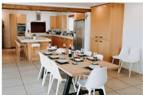
Kitchen & Dining Area