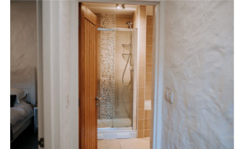
Lower Ground Floor Bathroom