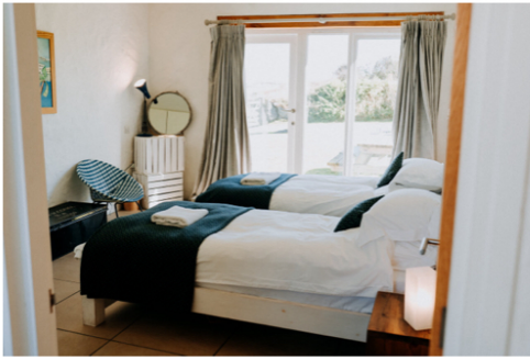
Upper Ground Floor Twin Bedroom