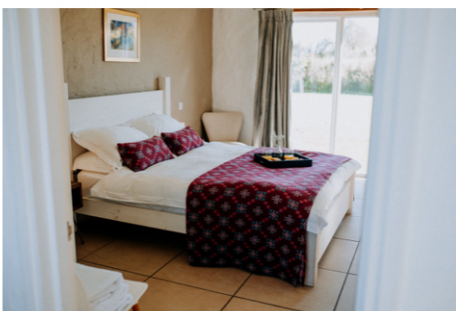
Upper Ground Floor Kingsize Bedroom & Ensuite Shower Room