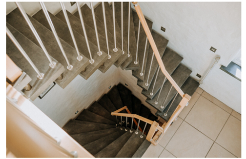
Stair to Lower Ground Floor