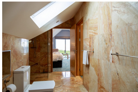
Second Floor Jack & Jill Shower Room