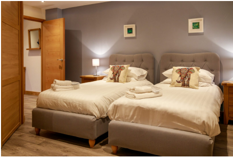
GF Twin Bedroom