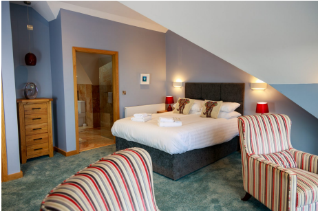
Second Floor Kingsize Bedroom