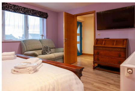
GF Kingsize Bedroom