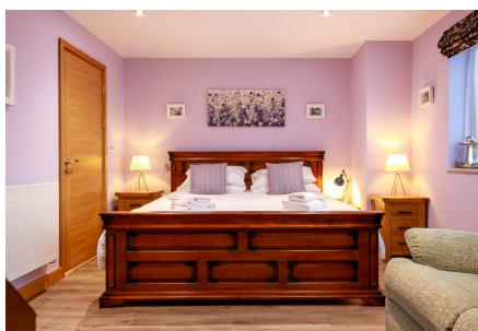
GF Kingsize Bedroom