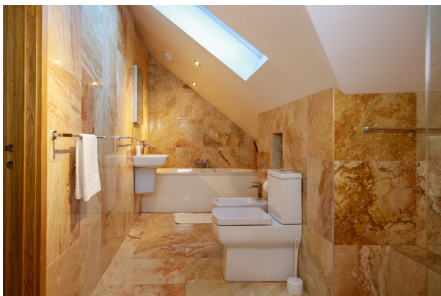
Second Floor Jack & Jill Shower Room