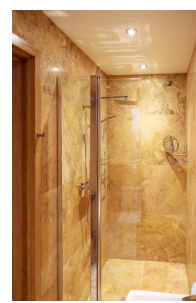
King Ensuite Shower Room