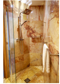
GF Ensuite Shower Room