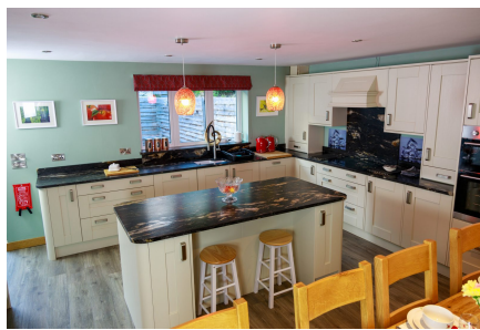
First Floor Kitchen