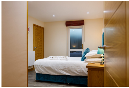
GF Double Bedroom