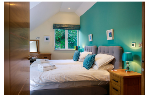
Second Floor Twin Bedroom