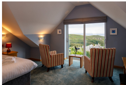
Second Floor Kingsize Bedroom