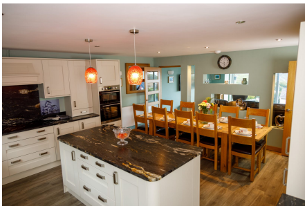
First Floor Kitchen & Dining