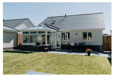
Garden & Patio Terrace