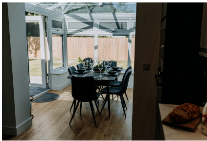
Kitchen & Sun Room