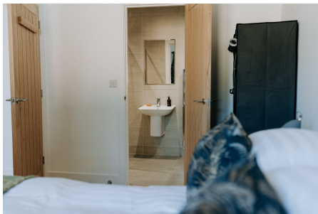
Bedroom & Ensuite