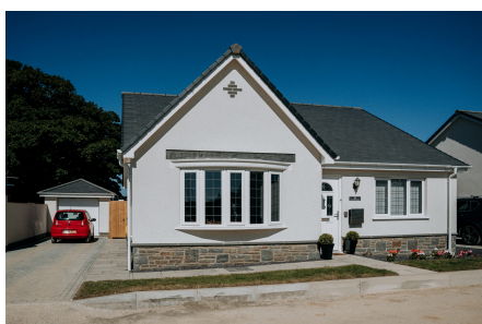
Parking & Entrance