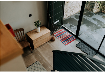
Entrance & Stairs