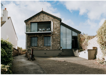
Parking & Entrance Door