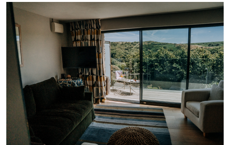
Sliding Doors to Balcony