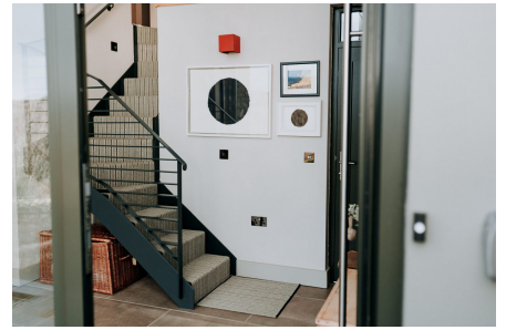
Entrance & Stairs