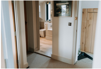
Landing & Hall