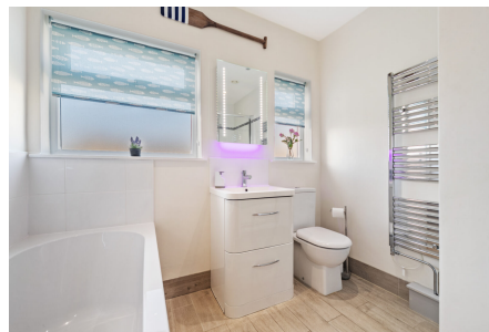
Bath & Shower Room