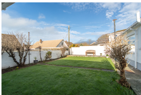
Rear Lawned Enclosed Garden