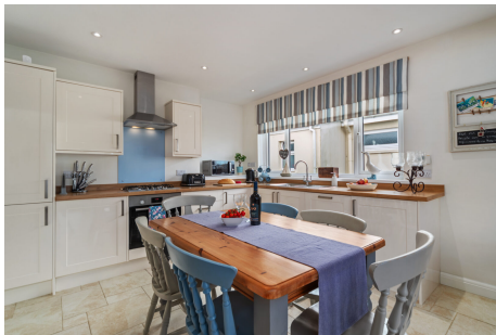
Kitchen & Dining Area