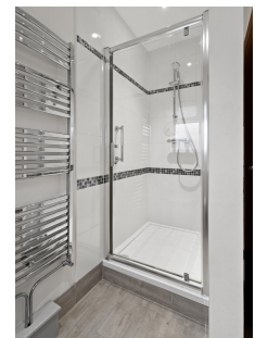
Bath & Shower Room