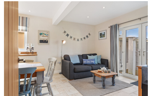
Lounge Dining Area