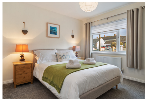
Kingsize Bedroom 1