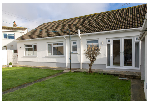
Rear Lawned Garden