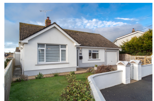
Front Enclosed Garden