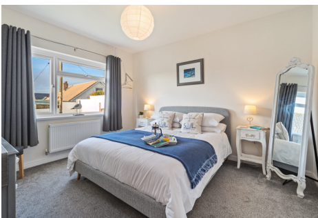
Kingsize Bedroom 1