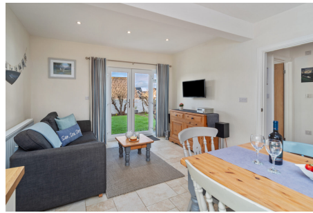
Lounge Dining Area