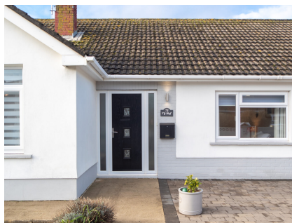
Path from Road to Entrance Door