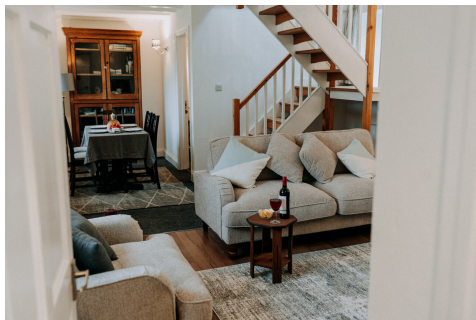
Lounge & Stair