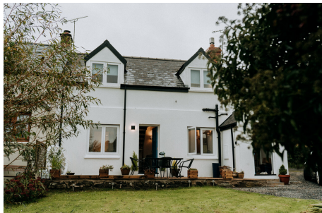
Entrance (Porch to the Right)