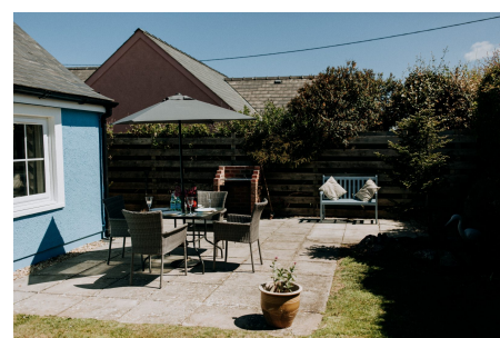
Garden & Terrace