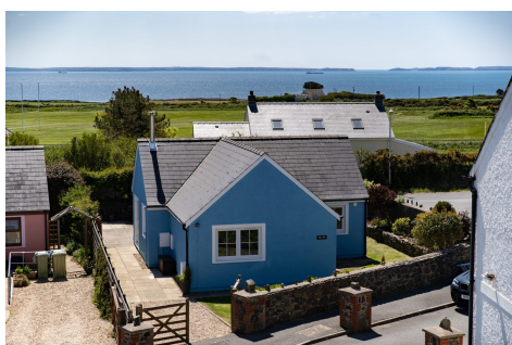
Gated Entrance & Drive