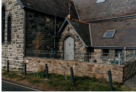
Enclosed Terrace to Entrance