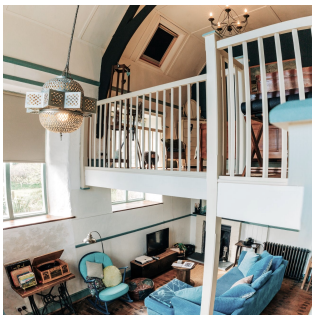
Gallery Bedroom Overlooking Lounge