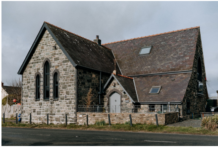
Parking Area (to the right)