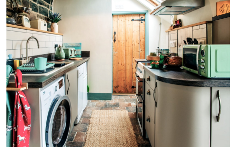
Kitchen (door to shower room)